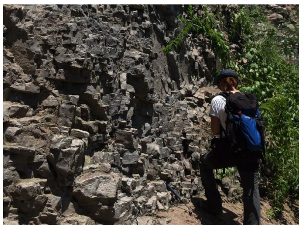
7α dark andesitic lava flows, highly fissured and fractured (Texaco district, 10 m NGM)