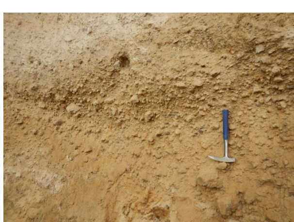
8pc pumice flows (Haut-Didier district, 160 m NGM)