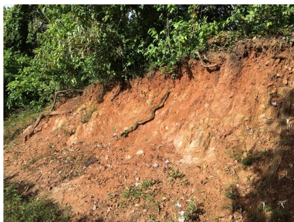
9αbi highly weathered andesitic lava flows (Fond Georges district, 400 m NGM)