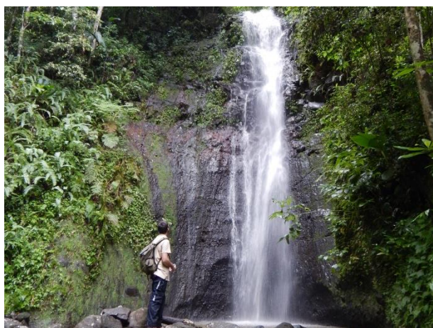
2α breccia andesitic lava flows (lower part) and massive and fractured lava flows (upper part) (Amba'So, Fond Lahaye valley, 180 m NGM)