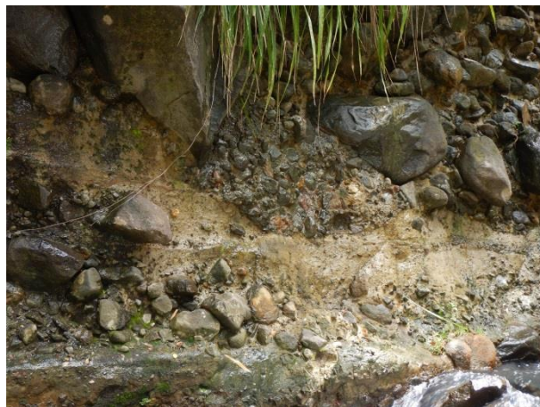
6C fluvial conglomerates (Case Navire river, 91 m NGM)