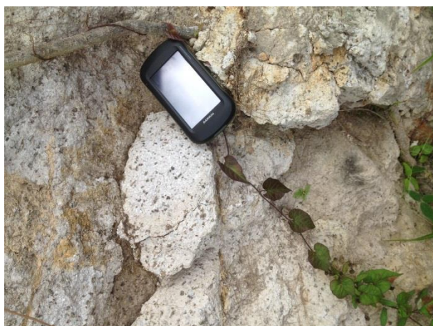
9αbi andesitic lava flow with quartz and biotite (Camp de Balata-Touret district, 430 m NGM)