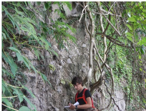
2α breccia andesitic lava flows (Fond Lahaye valley, 30 m NGM)