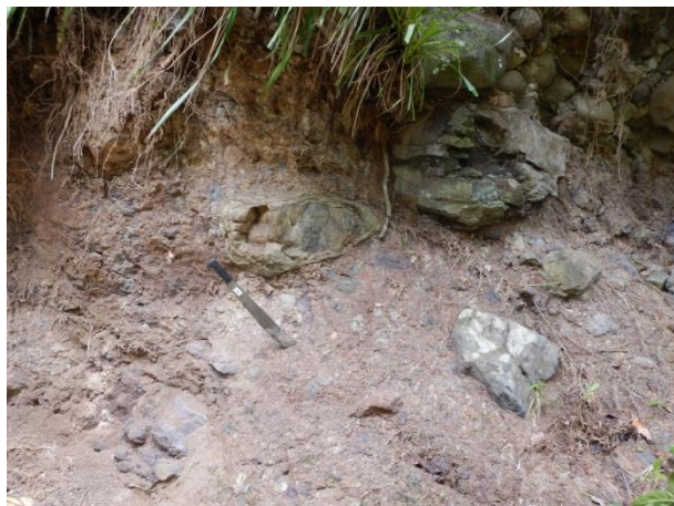
1H hyaloclastites (Case Navire river, 85 m NGM)