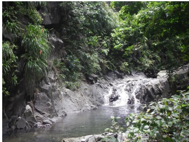
2α dark andesitic massive and fractured lava flows (Duclos river, 240 m NGM)