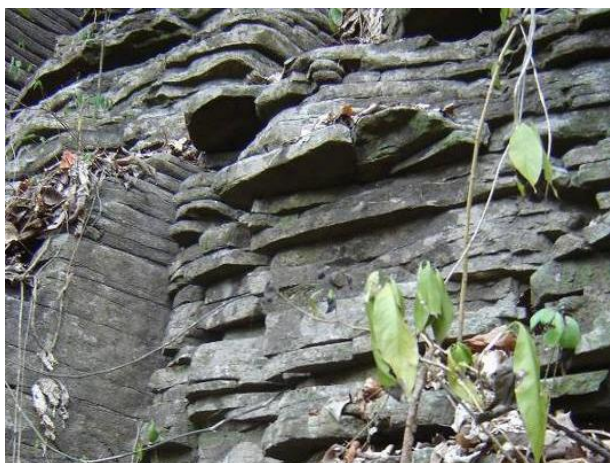
2α andesitic massive and fractured lava flows (Fond Lahaye valley, 100 m NGM)