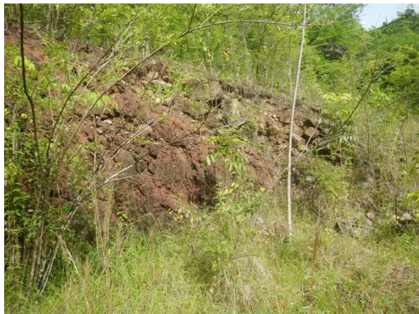
2α breccia andesitic lava flows (Fond Lahaye valley, 40 m NGM)